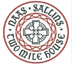
Image of the 'Lighted Cross' - Parish Bereavement Mass

We hold you close within our hearts, And there you shall remain, To walk with us throughout our lives, Until we meet again. So rest in peace dear loved ones, And thanks for all you've done, We pray God has given you, The crown you've truly won.