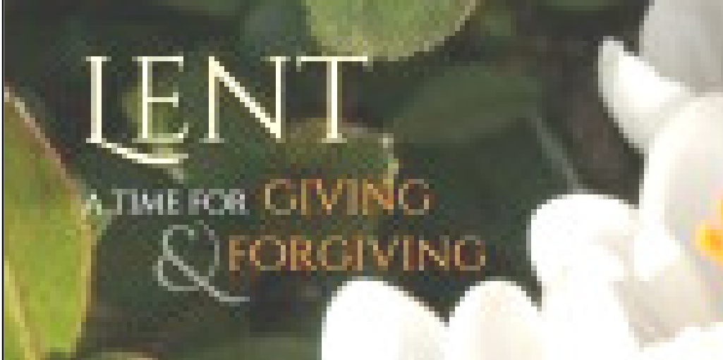
Mark 2: 13-25