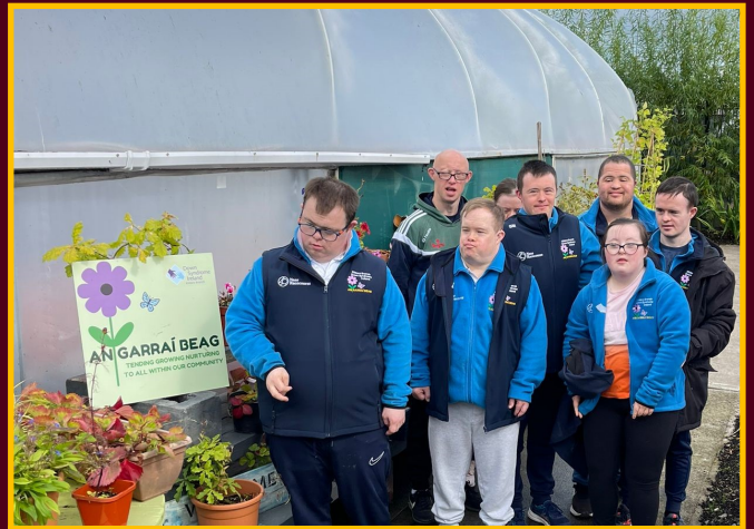
An Garraí Beag, KDSI, thriving & growing since 2019.