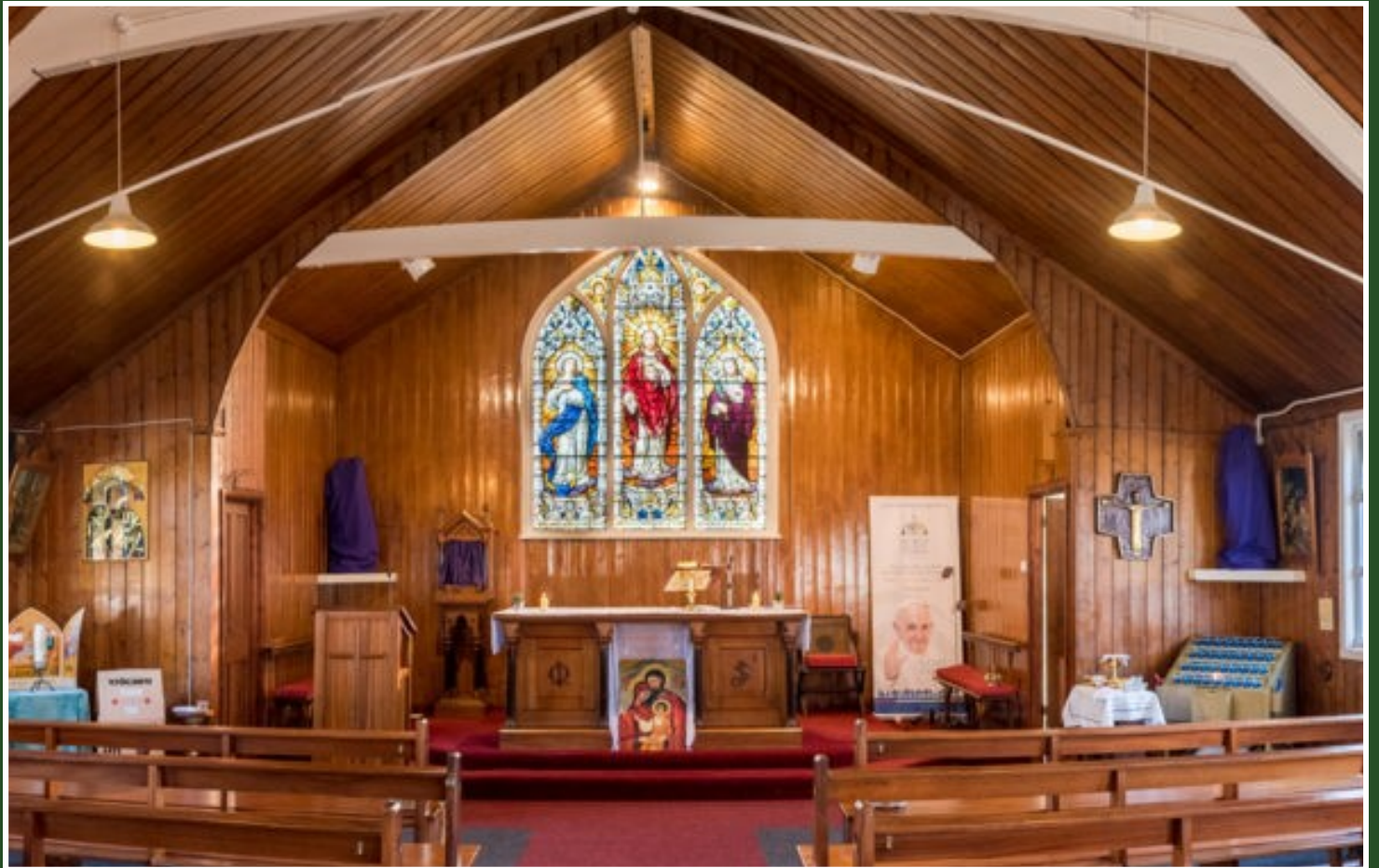
The Sanctuary now as we celebrate 100 years of praise & worship...